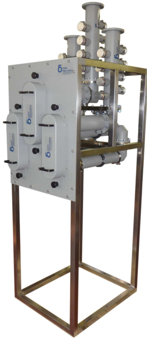
UHF SWITCHING UNIT Return loss Ch.36

EIA 4 1/2" Patch Panel/Power Divider for Dual Antenna System